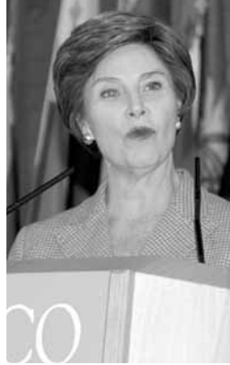
First Lady Laura Bush addresses UNESCO delegates.

From the moment they are born, our children's lives are shaped by the education we provide them." She also highlighted the role that global education plays in developing tolerance and hope in future generations, stating that, "The more children learn about other countries, faiths and cultures, the more likely they are to respect other people. Education can help children see beyond a world of hate and hopelessness."