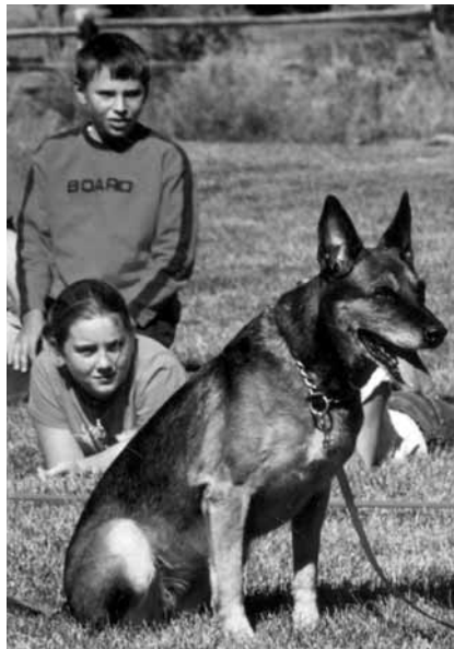
Rosa, a trained landmine dog that worked for six years in Albania, Bosnia, Croatia, Kosovo and Nambia, alerts her handler at the Jackson Hole Middle School demonstration